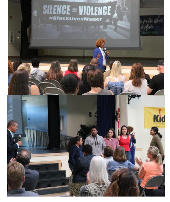
Thank you to those who attended the Courageous Conversations Parent & Community event on October 15th.